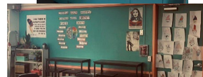
New paint, seating and more!!

PCS is only able to provide this level of donation to CCCS Staff and Students because of the generous support of our community and families, both in time and monetary donations.